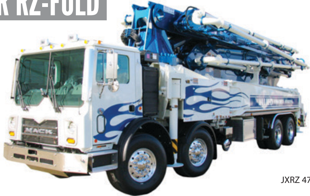
JXRZ 47-5.16 *